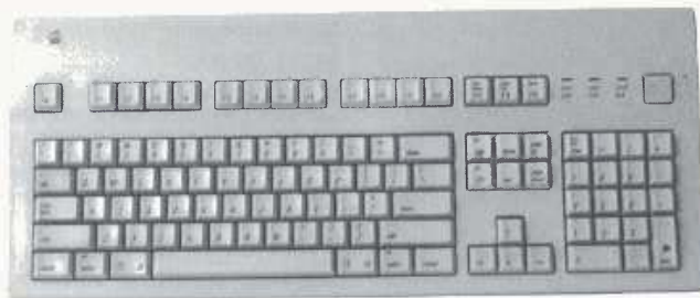
Apple Extended Keyboard.

application binary interface \a-plə-kā'shən bī-nār-ē in'tər-fās, bī'nār-ē\ n. A set of instructions that specifies how an executable file interacts with the hardware and how information is stored. Acronym: ABI (A'B-I'). Compare application programming interface.